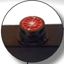
Rear Female panel connector