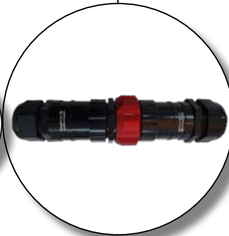
Male Multilock hoist connector